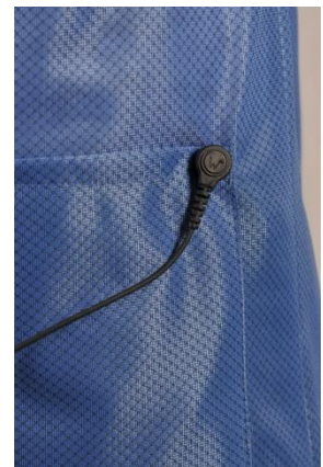
Standard Ground Cord connected to snap on pocket

(See back for dimensions & additional information)