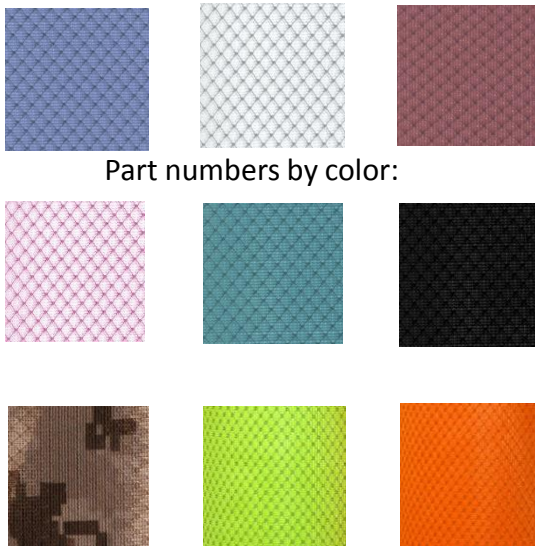
Part numbers by color: