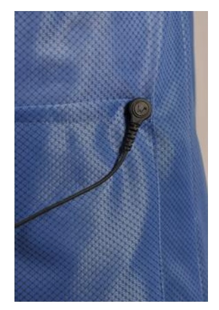
Standard Ground Cord connected to snap on pocket

LOJ-23C-(Size) Traditional Jacket Blue (plus 8 other colors) Long sleeve with ESD knit cuffs Front Snap Hip X-Small thru 8X-Large OFX-100 87% Poly/Carbon 13% 2.3 ounces per square yard ANSI/ESD STM2.1-Cat. 3 100 wash USA